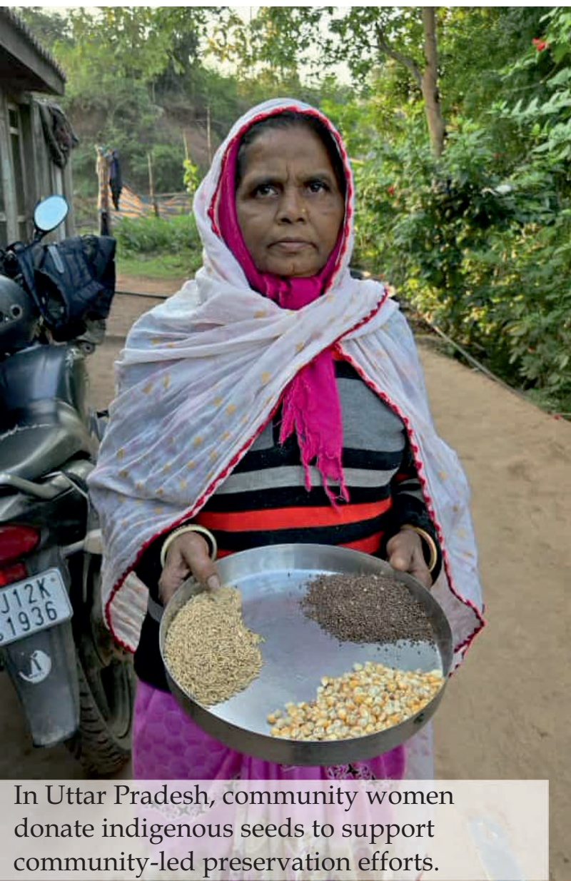
In Uttar Pradesh, community women donate indigenous seeds to support community-led preservation efforts.