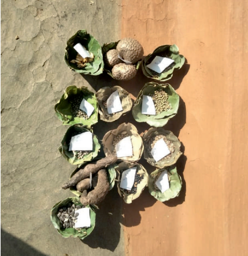
Odisha: Showcasing seeds collected from villagers.