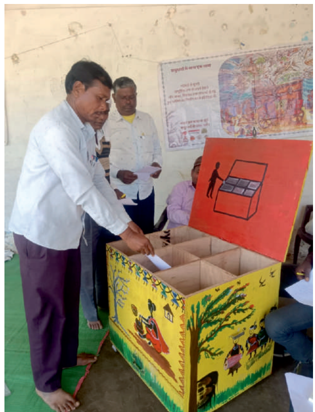
Madhya Pradesh: Gifts of wisdom for future generations.