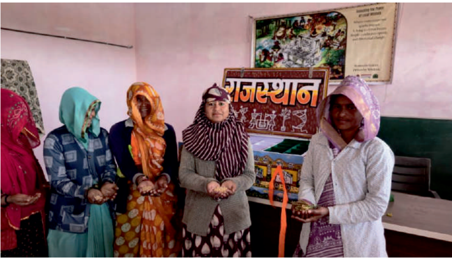
Rajasthan: Women showcasing seeds collected from villagers.