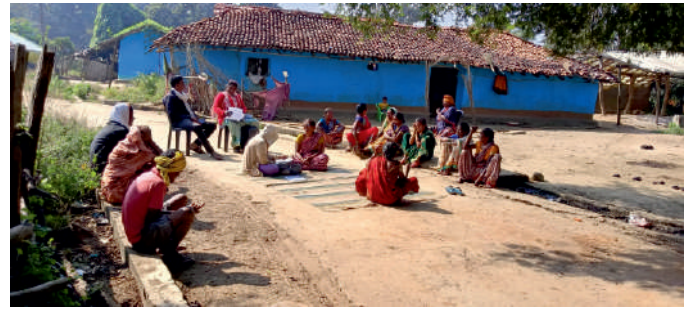
Gaon Chaupal in Gadchirauli, Maharashtra