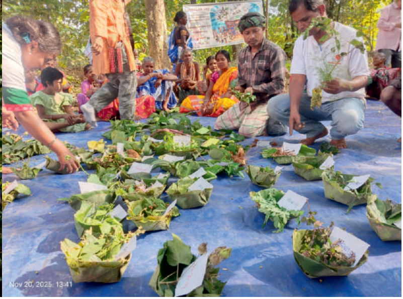
During the Forest Walk in Odisha, community members exchange insights on local medicinal plants.