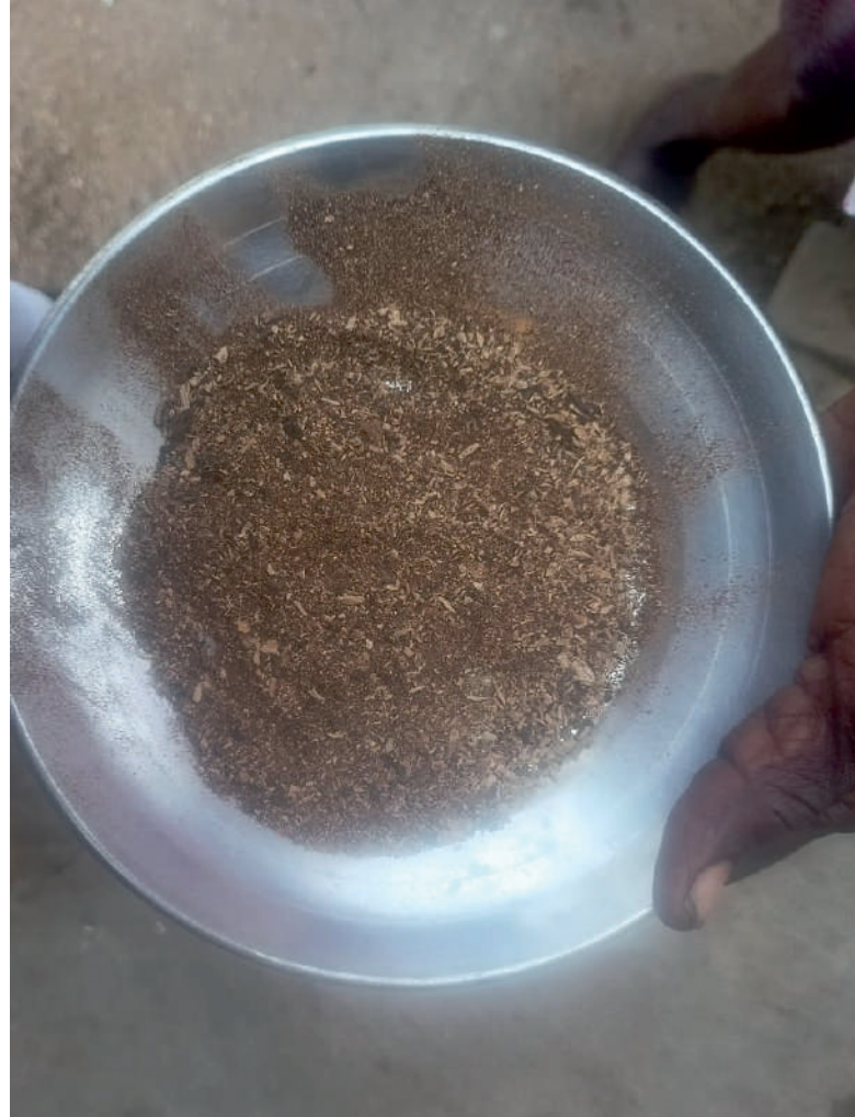
Maharashtra: Indigenous seeds collected by community members.