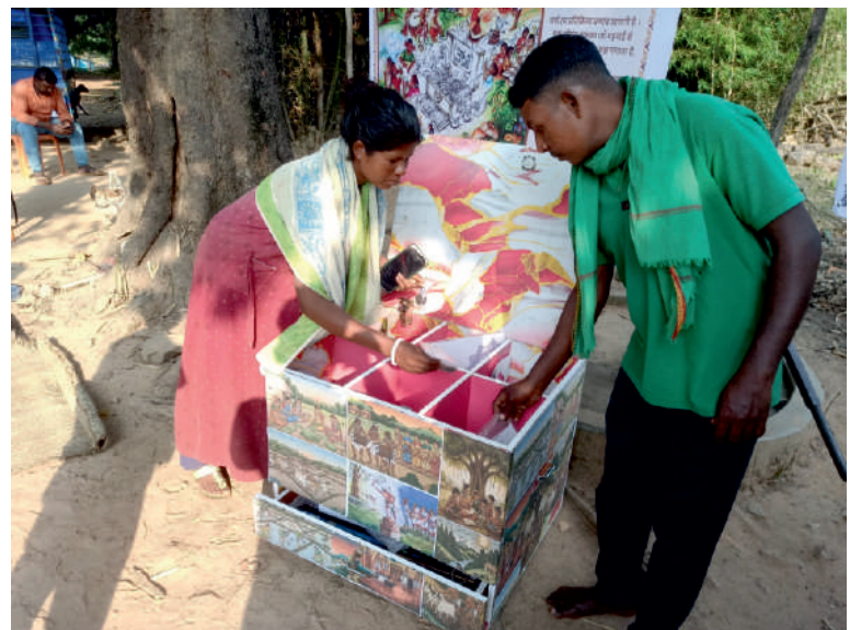
Community contribution of indigenous seeds from Jharkhand.