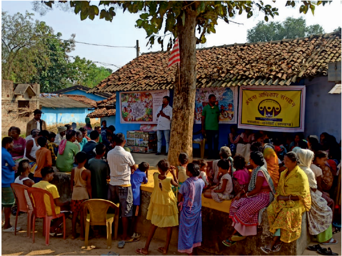
A Gaon Chaupal unfolds in Kuchai Block, Seraikela Kharsawan, Jharkhand, as the community comes together to reclaim their lost forest landscapes