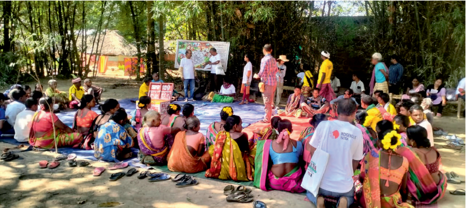
In Udala, Mayurbhanj, elders write powerful letters to their next generation, capturing memories, wisdom, and dreams for the future.