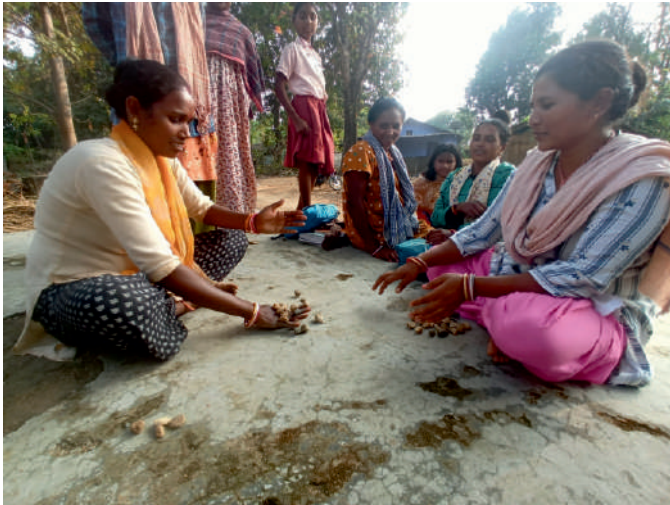
Tela Goti, a traditional game cherished by the Ho community in Jharkhand