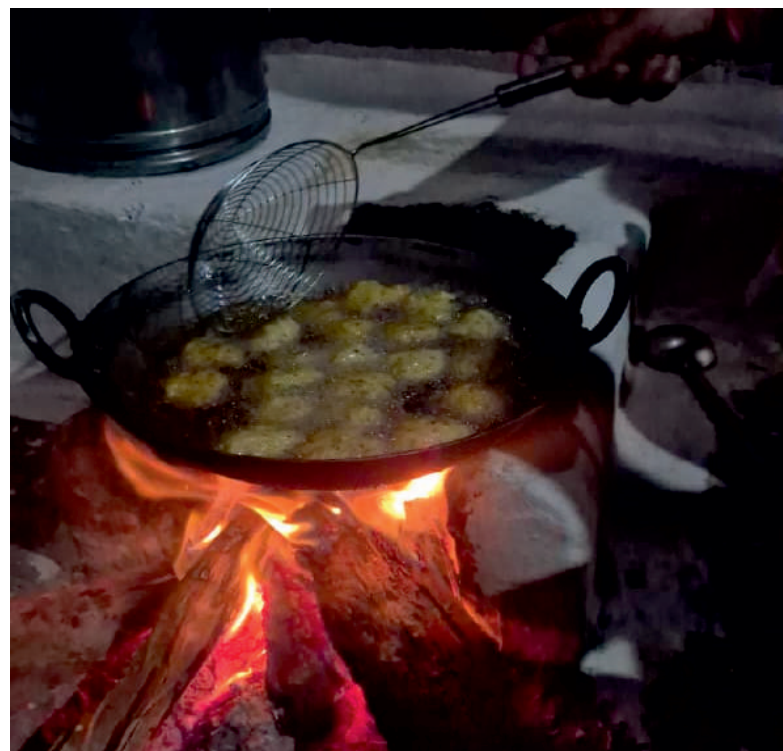
A local vada recipe prepared and shared by the community in Madhya Pradesh.