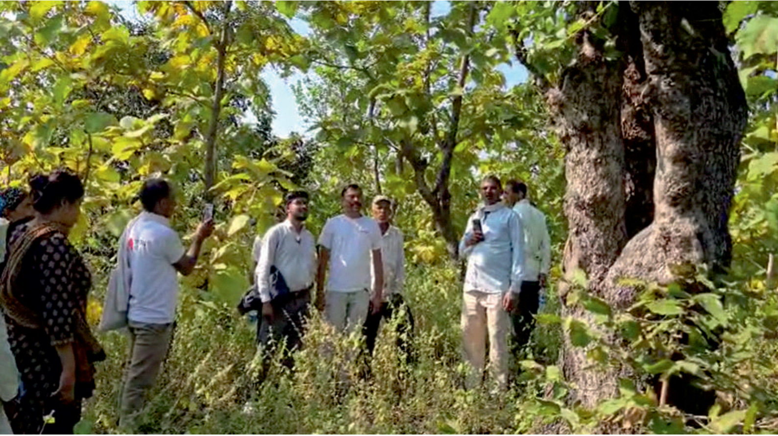
Forest walk in Bichchiwada Block of Rajasthan where 16 plant and herb species identified.