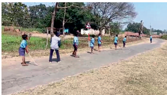
Chhattisgarh school children enjoying a traditional game during their leisure time.