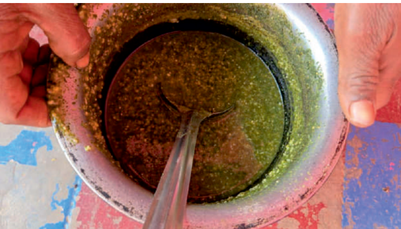
In Rajasthan, the community prepares a traditional chutney using medicinal herbs.