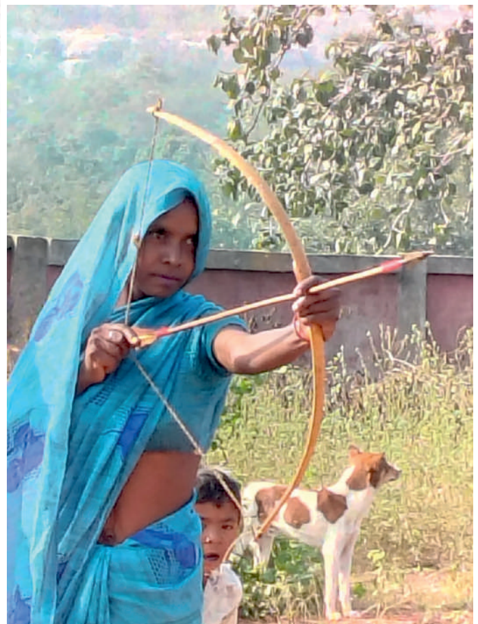
Community women in Uttar Pradesh practice archery, keeping their indigenous sporting traditions alive.