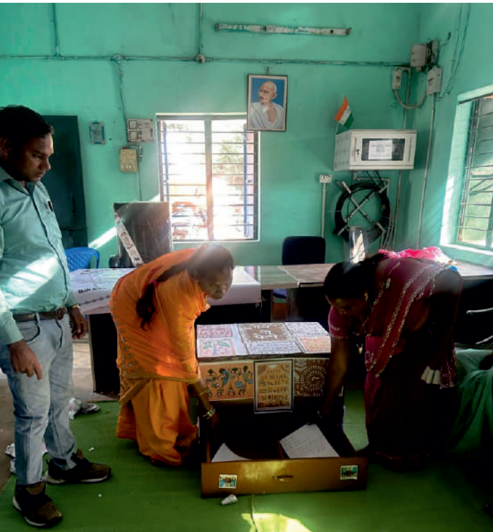
Chhattisgarh: Women pass on their wisdom to guide future generations.