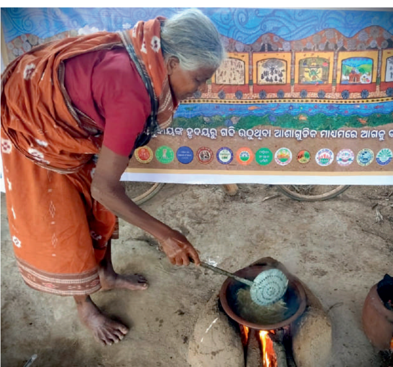
In Odisha, a woman prepares a traditional recipe made from indigenous foods.