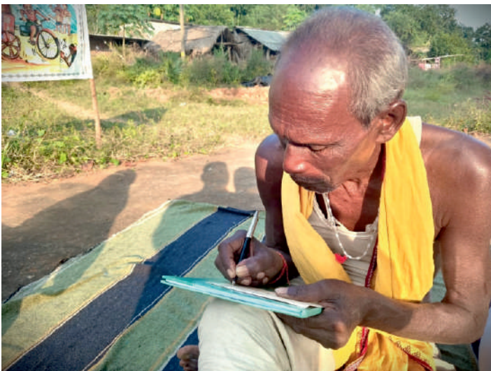
In Odisha, elders write heartfelt letters capturing their emotions and experiences.