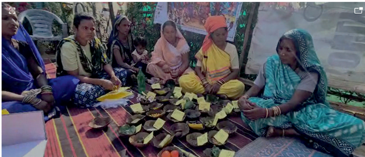
In Madhya Pradesh, community women display seeds and a variety of forest products collected during Forest Walk.