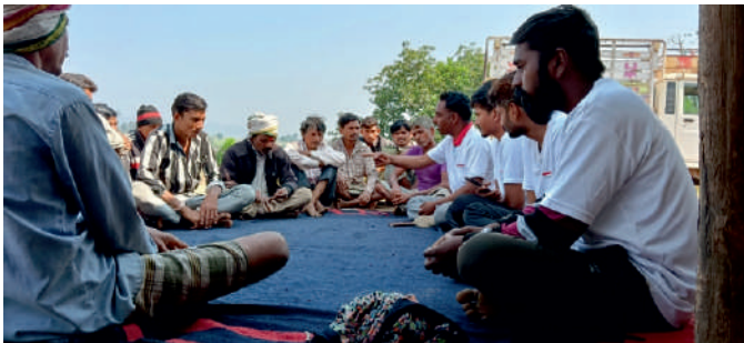
Gaon Chaupal in Alirajpur, Madhya Pradesh