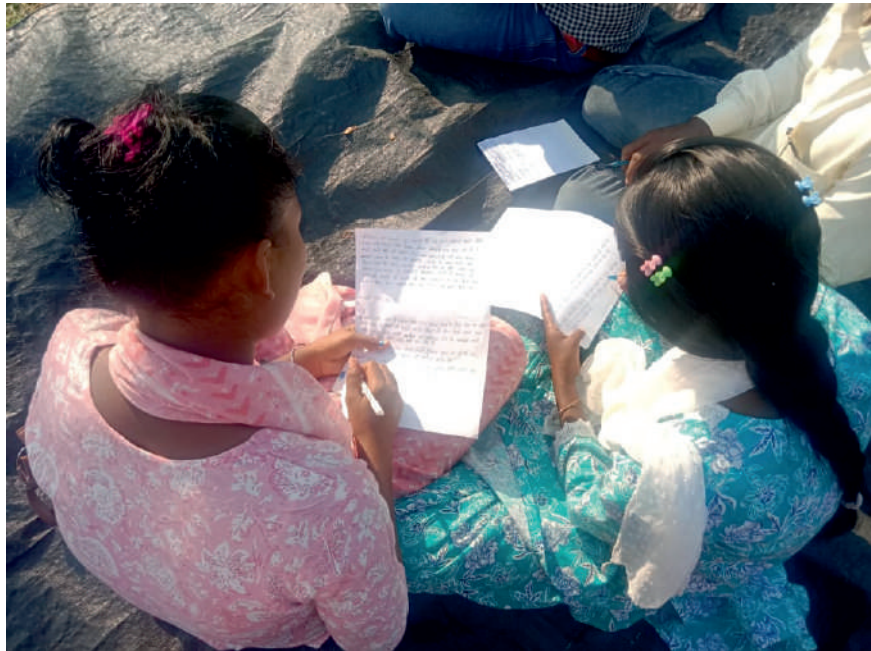
Jharkhand: A volunteer helps elders pen down their emotions.