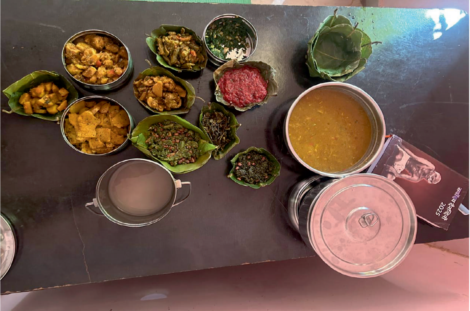
In Chhattisgarh, the community comes together to prepare a rich variety of traditional recipes.