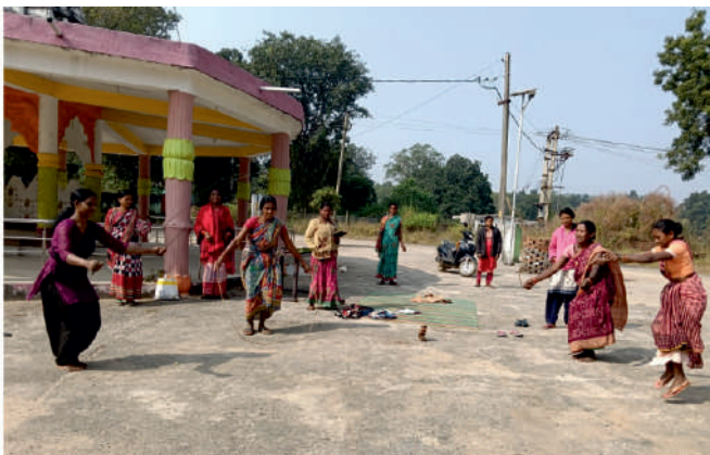
In Odisha, married women come together to play indigenous games and celebrate joy.