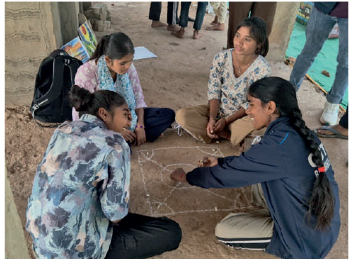
Kankad Khela — a traditional game of the Bhil community in Rajasthan