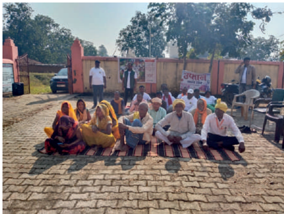
A moment captured from the Gaon Chaupal in Nagwa Block, Sonbhadra district, Uttar Pradesh