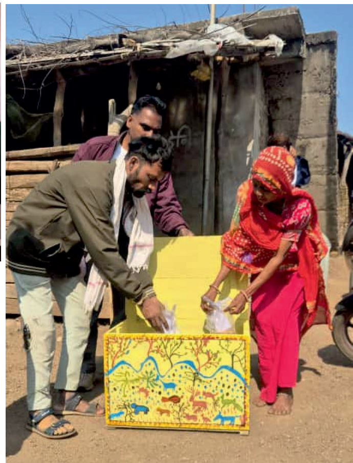
Villagers in Madhya Pradesh depositing seeds for community preservation.