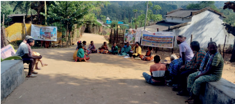
A Gaon Chaupal on climate change is in progress at Saka Gram Panchayat in Kandhamal district, Odisha.