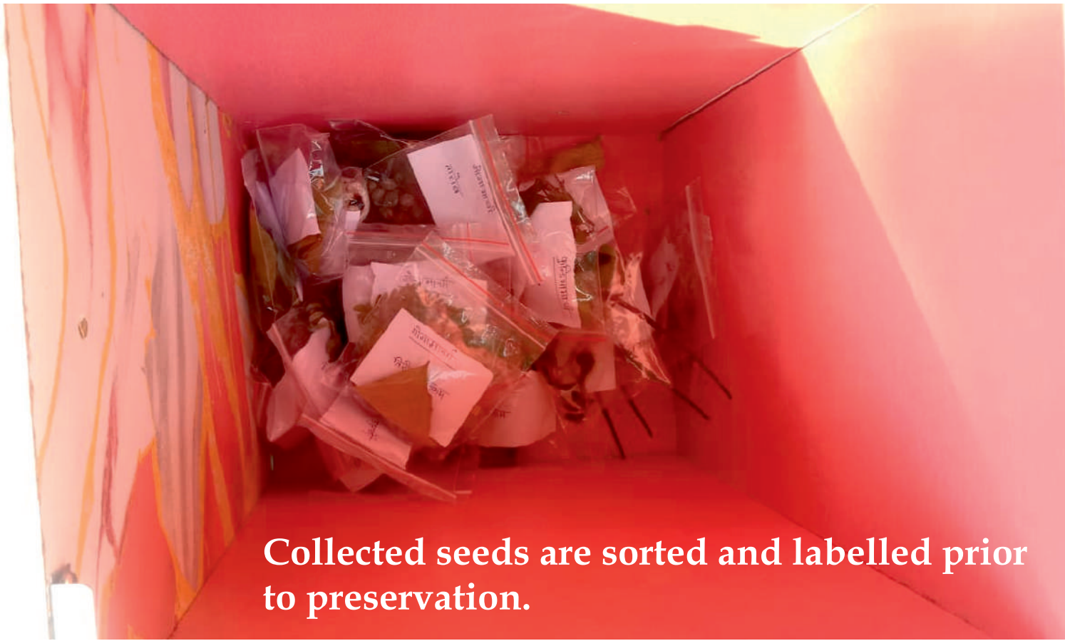
Collected seeds are sorted and labelled prior to preservation.