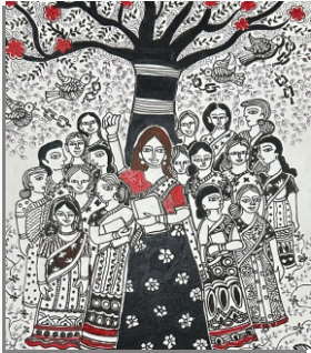
MENTORING OTHERS & SYSTEMS CHANGE